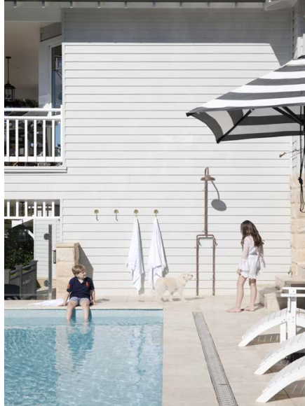
The renovated pool features travertine tiles and glass mosaics from Amber Tiles.

ACTUAL PAINT COLOURS MAY VARY ON APPLICATION