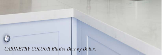
CABINETRY COLOUR Elusive Blue by Dulux.

SOURCE BOOK BUILDING & DESIGNER Cape Cod Australia, capecod.com.au . COLOUR CONSULTANT Ann King, annking.com.au .