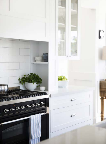
An eight-burner cooker ensures cooking with ease when feeding a family of six.

"THE DOWNSTAIRS LOUNGE AREA IS A REALLY LOVELY COSY SPOT" ~ KRISTIE