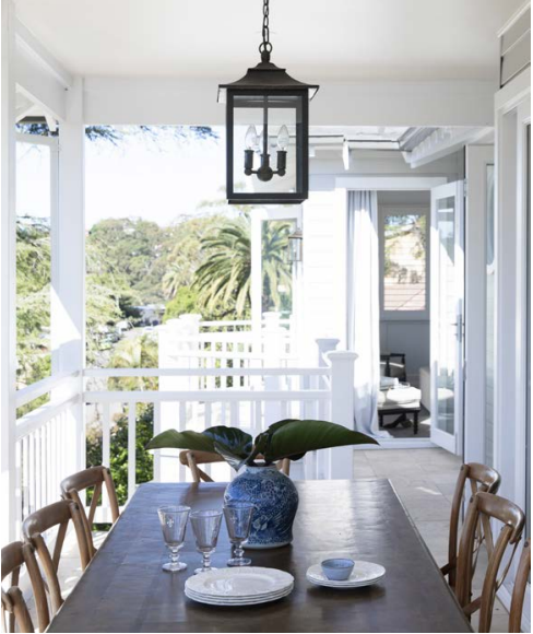
The outdoor dining space on the upper level captures the afternoon light when entertaining.